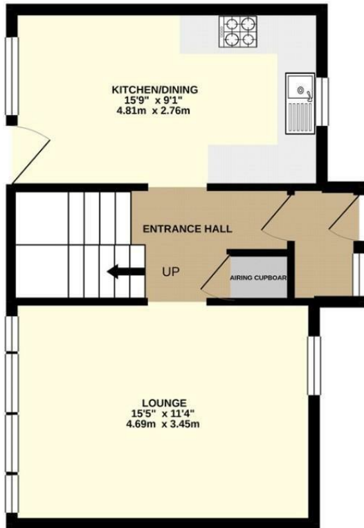
GROUND FLOOR 420 sq.ft. (39.1 sq.m.) approx.